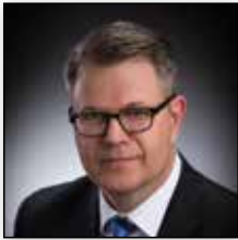
Brand Boyer Worden Thane, PC